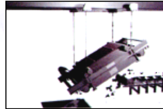
YXDC Self-cleaning Electromagnetic Separators